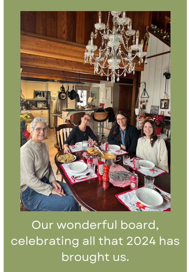
Our wonderful board, celebrating all that 2024 has brought us.